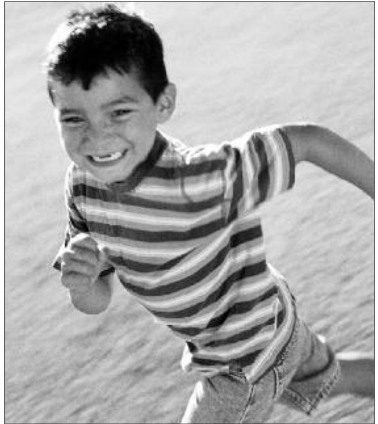
Galena Park ISD Migrant Program and Consulates of Central America and Mexico.

Some of the community partners we are working with include, Children's Defense Fund, Community Family Center, La Marque Teen Health Center, Spring Branch Family Development Center,